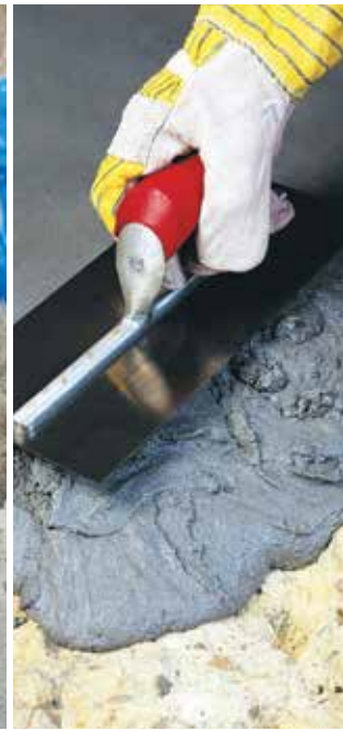
SEALANTS & REPAIR MORTARS