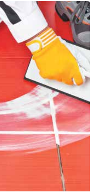
FLOORING & TILING